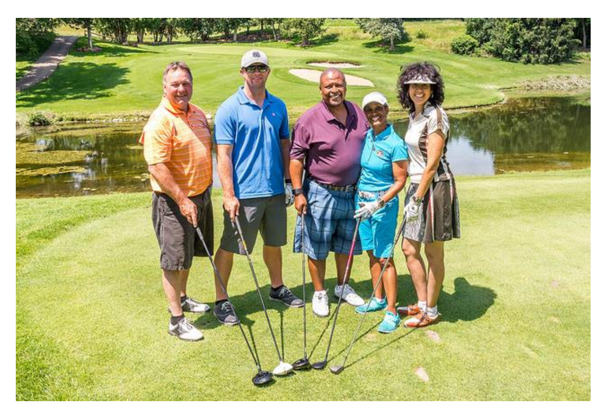
(From 2017 Golf Tournament in Detroit, Michigan)