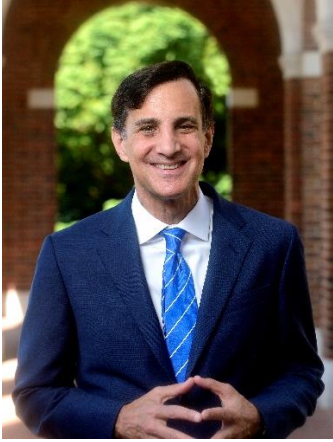
Johns Hopkins University