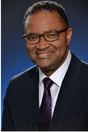
The Cordish Companies/Live! Casino & Hotel