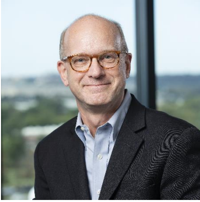
Clark Construction Group, LLC