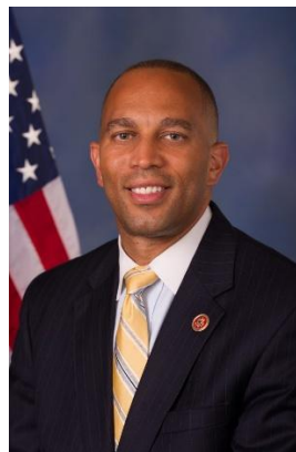
The Honorable Hakeem Jeffries Congressman, NY-08, Brooklyn, NY House Democratic Leader Most Dedicated and Distinguished Congressman to Fight for Our Democracy and Uphold the U.S. Constitution