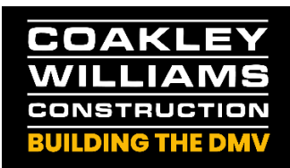
Coakley & Williams Construction Most Inclusive Prime Construction Company for Minority Business Enterprise