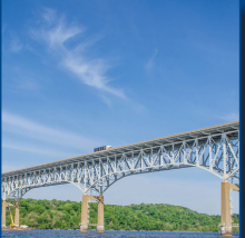
Millard E. Tydings Bridge

Agency: Maryland Transportation Authority Prime Contractor: EBA/Stantec/Baker, JV Project: MDTA Construction Management Inspection (CMI) Project Value: $10M Services Performed: Quality Control, Inspections, CPM Scheduling, Safety Management Date: Active