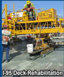
I-95 Deck Rehabilitation