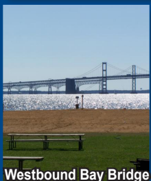
Westbound Bay Bridge

Agency: Maryland State Highway Administration Prime Contractor: Concrete General Project: I-270 Congestion Relief Project Project Value: $100M Services Performed: CPM Scheduling Date: Active