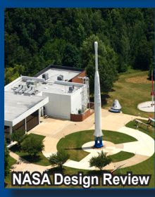
NASA Design Review