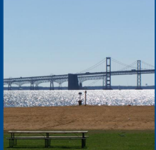
Sandy Point State Park