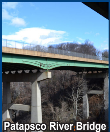
Patapsco River Bridge

Agency: MD State Highway Administration Prime Contractor: Blastech Enterprises, Inc. Project: Cleaning and Painting of Existing Bridge Nos. 1619701 and 1619702 on I-95 over Patapsco River in Prince George's County Project Value: $1.8M Services Performed: CPM Scheduling Date: Completed June 2016