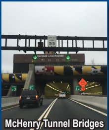
McHenry Tunnel Bridges

Agency: Maryland Transportation Authority Prime Contractor: Blastech Enterprises, Inc. Project: Millard E. Tydings Bridge Cleaning and Painting Structural Steel and Miscellaneous Repairs To Bridge on I-95 Over the Susquehanna River Project Value: $8.5M Services Performed: Project Management & CPM Scheduling Date: Completed December 2016