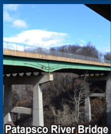
Patapsco River Bridge