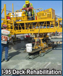
I-95 Deck Rehabilitation

Agency: MD State Highway Administration Prime Contractor: Kiewit Infrastructure Project: Deck Replacement and Miscellaneous Repairs Concrete Arch Bridge No. 1503300 on MD 195 (Carroll Avenue) over Sligo Creek Parkway and Sligo Creek Montgomery County Project Value: $9.3M Services Performed: Quality Control, Field Engineering Date: Completed May 2017